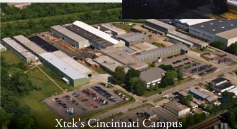
Xtek's Cincinnati Campus